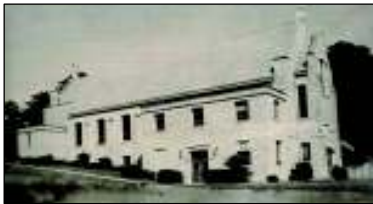
St. Thomas More Catholic Church, ca. 1966.

The Catholic Community of St. Thomas More can trace its roots to the University of North Carolina, where, as early as 1917, several Catholic students gathered for regular worship. From this small group's days as a mission to its eventual designation as a parish in 1940, mass was celebrated in various spaces on campus, which increased in size as the congregation grew. The arrival of some 1,000 Catholics with the Navy Pre-Flight program and the parish's continued growth after the war warranted a larger, more permanent worship space.