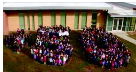
St. Thomas More Catholic School students and staff prepare to celebrate 50 years, 2013.

Over the course of its existence, St. Thomas More Catholic School has maintained the philosophy verbalized in its mission statement and executed it with compassion, as faculty and staff have always worked to nurture the whole child--intellectually, socially, and spiritually. In this, the school's 50th year, we rededicate ourselves to upholding the school's mission to educate each child in a God-centered environment, and to maintaining our enduring standards of academic excellence and service to others. Our faculty and staff will continue fulfilling this mission only with the continued involvement of parents, the stewardship of our parishioners and alumni, and the growth of the endowment fund established at the time of the school's 25th anniversary. With these goals in mind, we look forward to another fifty years of Catholic education here in Chapel Hill!