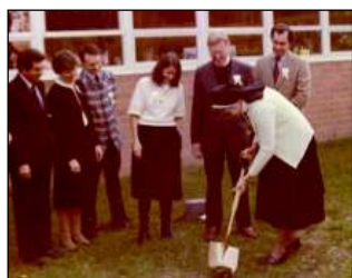
Groundbreaking for new wing, 1983.