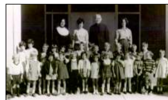
Kindergarten class with principal, pastor, and teachers, 1966.