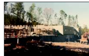
Construction of the middle school building, ca. 1997.

Even with construction underway for most of it, the next school year saw total enrollment over 400, three classes in both second and third grade, and several milestones--the first officers elected to student council, the first eighth grade trip to Washington, DC, and the first eighth grade class graduation, which included ten students who had attended the school since kindergarten. In other developments, the convent had its last year of use as a residence, as it was converted into office space for the priests and parish staff, and the sisters moved into a private home the parish had purchased in Colony Woods.