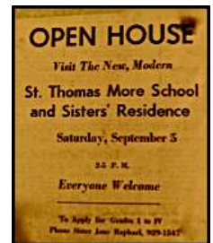
Open House flyer, 1964.