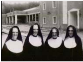
Sisters of Notre Dame de Namur outside convent, 1964.

who served as Superior, maintaining order and providing structure and guidance to the teaching sisters and the others in residence.