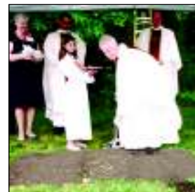
Groundbreaking for the Phase II building project, 2009.

The year also included another journey through the re-accreditation process, this time with AdvancEd, and the development of the School Improvement Plan for 2011-2015. Goals included improving data analysis, ensuring equity of learning, monitoring classroom interventions,