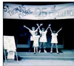
Celebrating the school's 25th Anniversary, 1989.