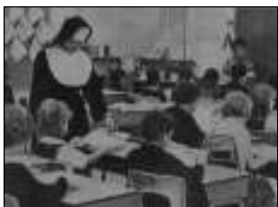
Working in the classroom, ca. 1964.

The first year was laden with new experiences for all those involved with the school--faculty and staff, as well as students and parents. The sisters worked countless hours in their classrooms during the week, helped with religious education on weekends, and spent their remaining waking hours cleaning, organizing, and making both the convent and the school their home. Praying together and supporting each other, the sisters worked to fulfill their order's mission to "make known God's goodness" as they educated the students.