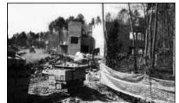
Construction of the school, 1963.